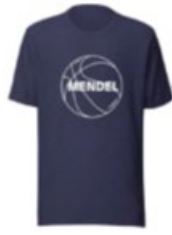
Mendel Basketball From $24.99 USD