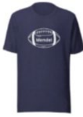
Mendel Football From $24.99 USD