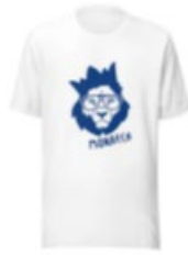
Mendel Lion Unisex Tee From $19.99 USD