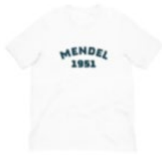
1951 Mendel Legacy White From $25.99 USD